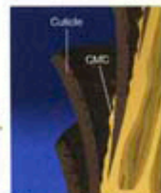
Damaged hair CMC flows out of hair and cuticles are being peeled off. The inner part of the cuticle itself is also damaged.

It means a condition in which surface cuticles are being peeled off and hair elements are flowing out through the cuticles. Especially, losing CMC (cell membrane complex) causes many gaps in a hair. These "flow channels" do not only let perming solution and coloring chemicals penetrate too deeply into the hair, but also let protein flow out of the hair. The important point of hair-care is to fill up these channels between cuticles with treatment agents.